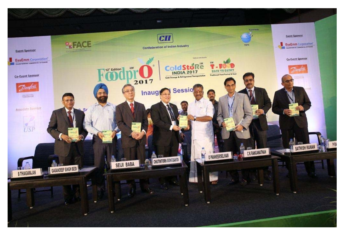
Foodpro 2017 is a technology exhibition for food processing industry and a platform to interface between the food technology sector and the food industry. Release of Show Catalogue by Thiru O Panneerselvam , Hon'ble Deputy Chief Minister Tamil Nadu