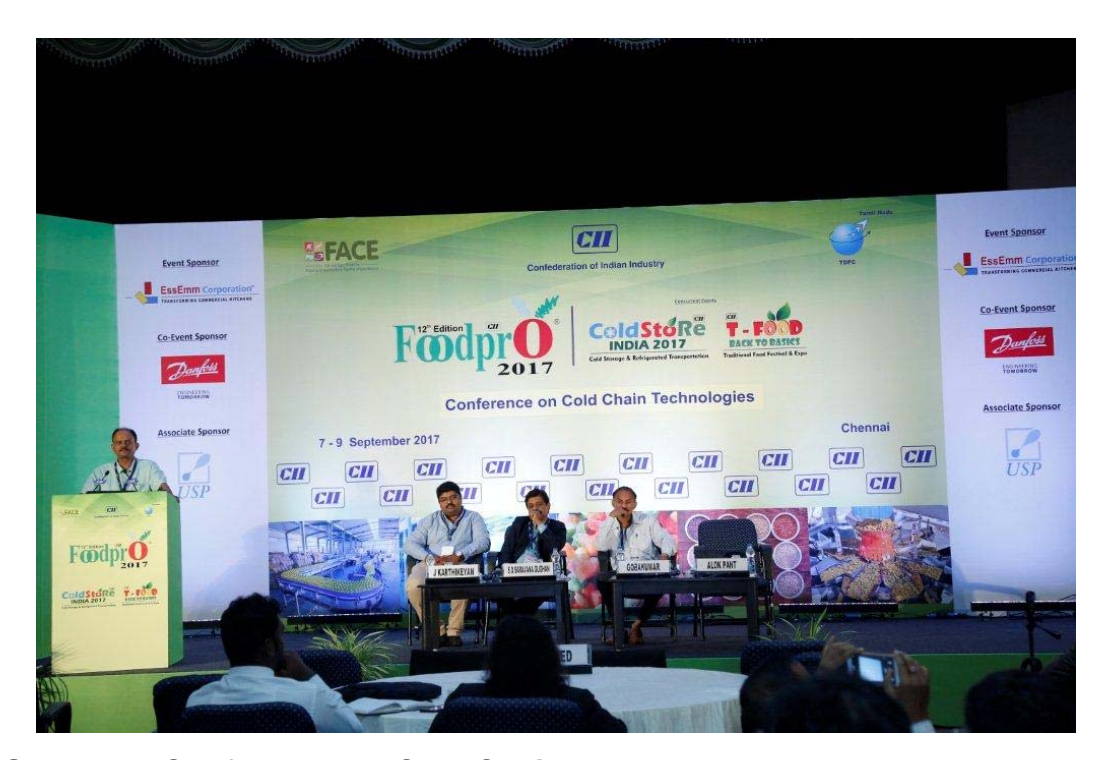
Day 2: 8 Sep 2017: Conference on Cold Chain Technology