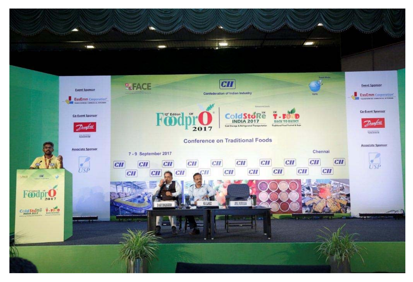
Day 3: 9 Sep 2017 Conference on Traditional Foods