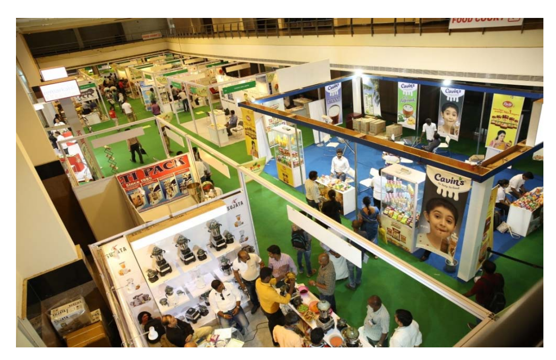
T-Food , a traditional food festival, brought awareness about the traditional and local foods, especially millets. The Show presented newer recipes of cooking traditional foods and provided opportunity to entrepreneurs to showcase the developments in processing of Traditional Food.